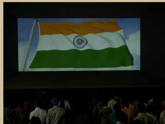
Voice in the crowd, Goa SALIL CHATURVEDI